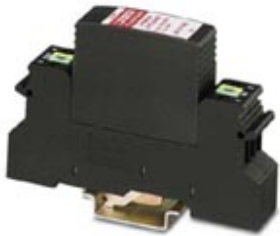
Protective plug UFBK-M with two conductor protection in floating signal circuits. Nominal voltage: 5 V DC

Please be informed that the data shown in this PDF Document is generated from our Online Catalog. Please find the complete data in the user's documentation. Our General Terms of Use for Downloads are valid ( http://phoenixcontact.com/download )