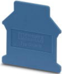
End cover, Length: 42.5 mm, Width: 1.5 mm, Height: 54 mm, Color: blue

Please be informed that the data shown in this PDF Document is generated from our Online Catalog. Please find the complete data in the user's documentation. Our General Terms of Use for Downloads are valid ( http://phoenixcontact.com/download )