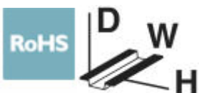
The figure shows EMG 17-REL/KSR-G 24/2E/SO38

Relay module, with soldered-in miniature switching relay, contact (AgNi): Medium to large loads, double A2 connection, 1 PDT, 120 V AC/DC input voltage