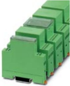
Electronic housing for installation distributors, for insertion of a PCB

Please be informed that the data shown in this PDF Document is generated from our Online Catalog. Please find the complete data in the user's documentation. Our General Terms of Use for Downloads are valid ( http://phoenixcontact.com/download )