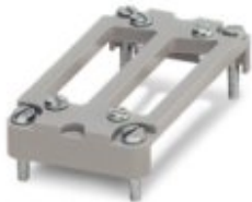
D-SUB adapter plate, for two D-SUB connectors, no. of positions 25, housing series HC-B 10...

Please be informed that the data shown in this PDF Document is generated from our Online Catalog. Please find the complete data in the user's documentation. Our General Terms of Use for Downloads are valid ( http://phoenixcontact.com/download )