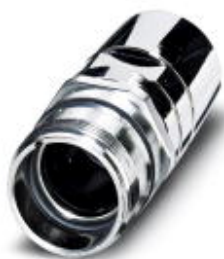
Sleeve housing for coupler connector, straight, Screw locking, M23, shielded: no

Please be informed that the data shown in this PDF Document is generated from our Online Catalog. Please find the complete data in the user's documentation. Our General Terms of Use for Downloads are valid ( http://phoenixcontact.com/download )