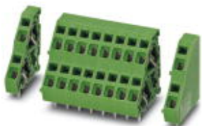
The figure shows a 10-pos. version with 20 contacts

PCB terminal block, nominal current: 17.5 A, nom. voltage: 400 V, pitch: 5.08 mm, number of positions: 1, connection method: Spring-cage connection, mounting: Wave soldering, conductor/PCB connection direction: 45°, color: black