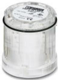
LED permanent light element, 24 V AC/DC, clear

Please be informed that the data shown in this PDF Document is generated from our Online Catalog. Please find the complete data in the user's documentation. Our General Terms of Use for Downloads are valid ( http://phoenixcontact.com/download )