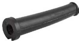
4804.0001 Sleeve black, 5.6 mm