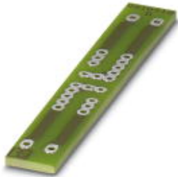
PCB for assembling electronic components

Please be informed that the data shown in this PDF Document is generated from our Online Catalog. Please find the complete data in the user's documentation. Our General Terms of Use for Downloads are valid ( http://phoenixcontact.com/download )