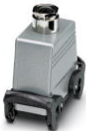
HEAVYCON coupling housing B16, with double locking latch, height 80 mm, with screw connection 1x Pg21

Please be informed that the data shown in this PDF Document is generated from our Online Catalog. Please find the complete data in the user's documentation. Our General Terms of Use for Downloads are valid ( http://phoenixcontact.com/download )