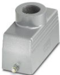
HEAVYCON sleeve housing B16, with single locking latch, height 45 mm, with support M25, straight conductor exit

Please be informed that the data shown in this PDF Document is generated from our Online Catalog. Please find the complete data in the user's documentation. Our General Terms of Use for Downloads are valid ( http://phoenixcontact.com/download )