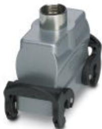
HEAVYCON B16 sleeve housing, with double locking latch, height: 56 mm, with 1 x Pg21 gland, straight cable outlet

Please be informed that the data shown in this PDF Document is generated from our Online Catalog. Please find the complete data in the user's documentation. Our General Terms of Use for Downloads are valid ( http://phoenixcontact.com/download )