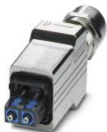
Push-pull connector (version 14), die-cast zinc, with SC-RJ insert for POF, for cable diameter of 5.5 mm ... 10 mm

Please be informed that the data shown in this PDF Document is generated from our Online Catalog. Please find the complete data in the user's documentation. Our General Terms of Use for Downloads are valid ( http://phoenixcontact.com/download )