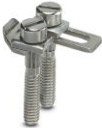
Switching jumper, Number of positions: 2, Color: silver

Please be informed that the data shown in this PDF Document is generated from our Online Catalog. Please find the complete data in the user's documentation. Our General Terms of Use for Downloads are valid ( http://phoenixcontact.com/download )