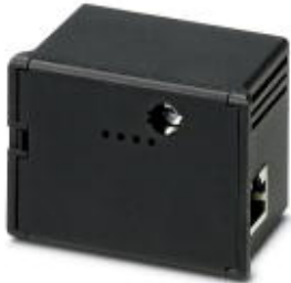
Ethernet communication module for the EEM-MA600 with integrated web server

Please be informed that the data shown in this PDF Document is generated from our Online Catalog. Please find the complete data in the user's documentation. Our General Terms of Use for Downloads are valid ( http://phoenixcontact.com/download )