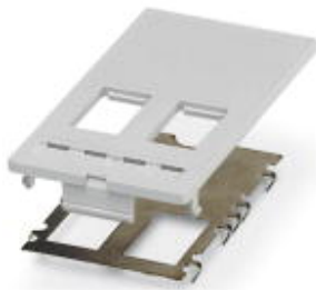
Front plate, plastic with shroud, for 2x RJ with modular system (Keystone)

Please be informed that the data shown in this PDF Document is generated from our Online Catalog. Please find the complete data in the user's documentation. Our General Terms of Use for Downloads are valid ( http://phoenixcontact.com/download )