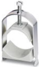
Cable clamp, for DIN rails

Please be informed that the data shown in this PDF Document is generated from our Online Catalog. Please find the complete data in the user's documentation. Our General Terms of Use for Downloads are valid ( http://phoenixcontact.com/download )