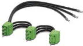
Figure shows variant for 3 modules

3-phase loop bridge for 10 CONTACTRON modules, with screw connection and 22.5 mm housing width, connecting cable: 0.3 m, with ferrules.