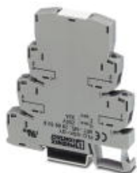
Power terminal block, for the input of up to four potentials, for mounting on NS 35/7.5

Please be informed that the data shown in this PDF Document is generated from our Online Catalog. Please find the complete data in the user's documentation. Our General Terms of Use for Downloads are valid ( http://phoenixcontact.com/download )