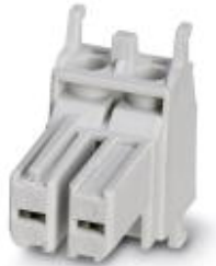
Contact insert module, for sleeve frames, with screw connection, 1-pos. + PE connection, 400 V / 20 A

Please be informed that the data shown in this PDF Document is generated from our Online Catalog. Please find the complete data in the user's documentation. Our General Terms of Use for Downloads are valid ( http://phoenixcontact.com/download )