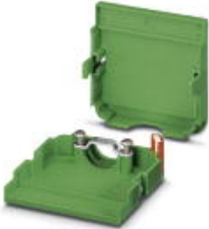
Cable housing, Pitch: 3.81 mm, Number of positions: 13, Dimension a: 51.92 mm, Color: green

Please be informed that the data shown in this PDF Document is generated from our Online Catalog. Please find the complete data in the user's documentation. Our General Terms of Use for Downloads are valid ( http://phoenixcontact.com/download )