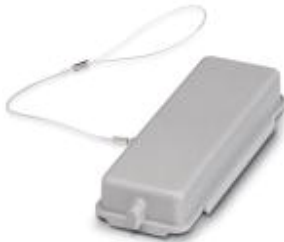
HEAVYCON protective cover, type B24, for supporting base element with single locking latch, with retaining cord, IP54, PA

Please be informed that the data shown in this PDF Document is generated from our Online Catalog. Please find the complete data in the user's documentation. Our General Terms of Use for Downloads are valid ( http://phoenixcontact.com/download )