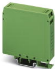
Electronic housing, for PCB insertion, fully equipped with 3 screw or 6 tab connections per side

Please be informed that the data shown in this PDF Document is generated from our Online Catalog. Please find the complete data in the user's documentation. Our General Terms of Use for Downloads are valid ( http://phoenixcontact.com/download )