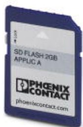
Program and configuration memory

Please be informed that the data shown in this PDF Document is generated from our Online Catalog. Please find the complete data in the user's documentation. Our General Terms of Use for Downloads are valid ( http://phoenixcontact.com/download )