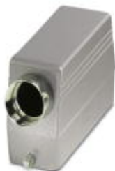
HEAVYCON sleeve housing B16, with single locking latch, height 76 mm, with support M25, lateral conductor exit

Please be informed that the data shown in this PDF Document is generated from our Online Catalog. Please find the complete data in the user's documentation. Our General Terms of Use for Downloads are valid ( http://phoenixcontact.com/download )