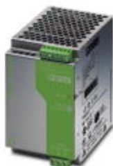
DIN rail power supply unit, primary-switched mode, 1-phase, output: 24 V DC / 10 A, for the potentially explosive area

Please be informed that the data shown in this PDF Document is generated from our Online Catalog. Please find the complete data in the user's documentation. Our General Terms of Use for Downloads are valid ( http://phoenixcontact.com/download )