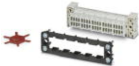
The figure shows the 40-pos. version

Contact insert set for mounting side, sleeve frame with PE, 4 fixing screws, 8-pos. contact inserts preassembled, 6 coding profiles, 2 mounting flanges