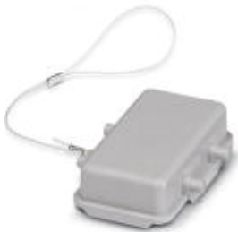
HEAVYCON protective cover, series B10, for supporting base element with double locking latch, with retaining cord, IP54, PA

Please be informed that the data shown in this PDF Document is generated from our Online Catalog. Please find the complete data in the user's documentation. Our General Terms of Use for Downloads are valid ( http://phoenixcontact.com/download )