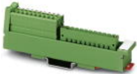
The illustration shows version UM 25-10 MSTB/FRONT/Q

VARIOFACE SLIM LINE, with screw connection and COMBICON header, for assembly at a right angle on NS 35/7.5, 18 positions