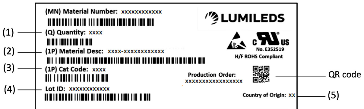
Figure 13a: Example of reel label format A.