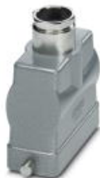
HEAVYCON B16 sleeve housing, for single locking latch, height: 76 mm, with 1 x Pg21 screw connection, straight cable outlet

Please be informed that the data shown in this PDF Document is generated from our Online Catalog. Please find the complete data in the user's documentation. Our General Terms of Use for Downloads are valid ( http://phoenixcontact.com/download )