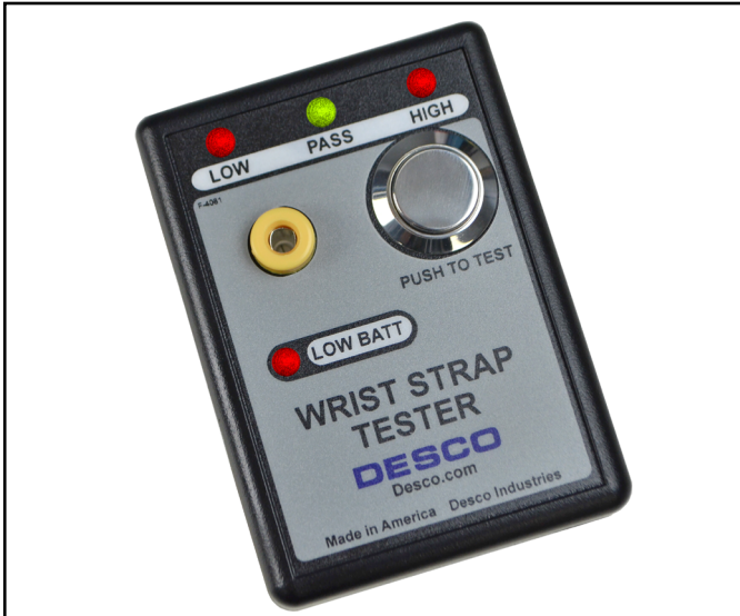
Figure 1. Desco 19240 Portable Wrist Strap Tester