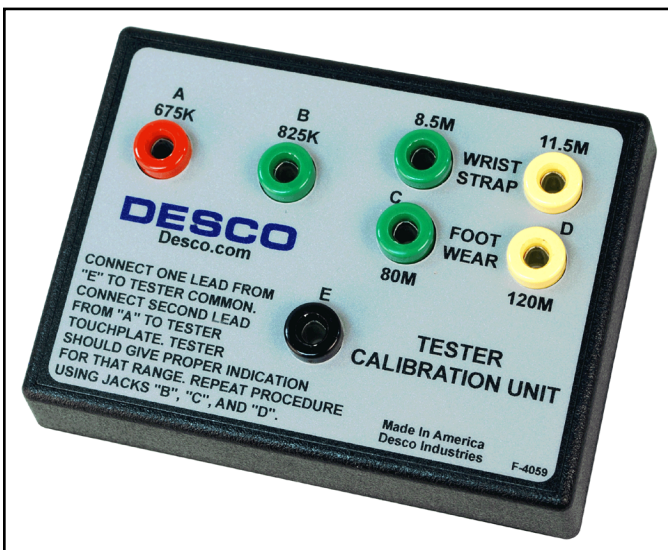
Figure 3. Desco 07010 Calibration Unit

View technical bulletin TB-2039 for more information on the Desco 07010 Calibration Unit and instructions to calibrate the Wrist Strap Tester.