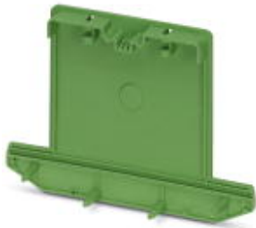
Side element, tall version, for closing both ends of the base element UM-BEFE, for 73 mm wide U-shaped profile cover

Please be informed that the data shown in this PDF Document is generated from our Online Catalog. Please find the complete data in the user's documentation. Our General Terms of Use for Downloads are valid ( http://phoenixcontact.com/download )