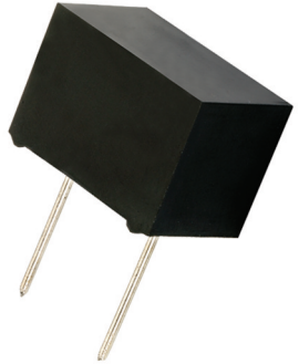
Actual Size (Max.)