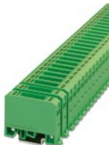
Electronic housing, with universal foot, for PCB insertion

Please be informed that the data shown in this PDF Document is generated from our Online Catalog. Please find the complete data in the user's documentation. Our General Terms of Use for Downloads are valid ( http://phoenixcontact.com/download )