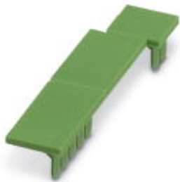
Terminal cover, 1 strip covers up to 12 terminal points, for ME-BUS terminal opening, (male side)

Please be informed that the data shown in this PDF Document is generated from our Online Catalog. Please find the complete data in the user's documentation. Our General Terms of Use for Downloads are valid ( http://phoenixcontact.com/download )