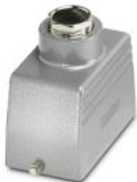
Sleeve housing, for single locking latch, height 45 mm, with screw connection, 1x Pg16, straight cable entry

Please be informed that the data shown in this PDF Document is generated from our Online Catalog. Please find the complete data in the user's documentation. Our General Terms of Use for Downloads are valid ( http://phoenixcontact.com/download )