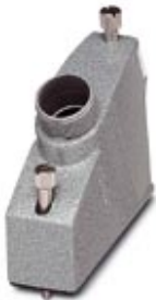
Metal sleeve housing, powder-coating, locking screws with knurled head, type 3, cable screw connection Pg21

Please be informed that the data shown in this PDF Document is generated from our Online Catalog. Please find the complete data in the user's documentation. Our General Terms of Use for Downloads are valid ( http://phoenixcontact.com/download )