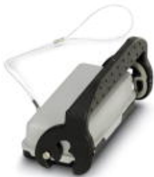
HEAVYCON protective cover, type B16, for sleeve housing without single locking latch, with retaining cord, IP54

Please be informed that the data shown in this PDF Document is generated from our Online Catalog. Please find the complete data in the user's documentation. Our General Terms of Use for Downloads are valid ( http://phoenixcontact.com/download )