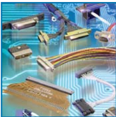
Microdot Connectors and Cables