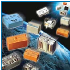
Schrack PCB Relays