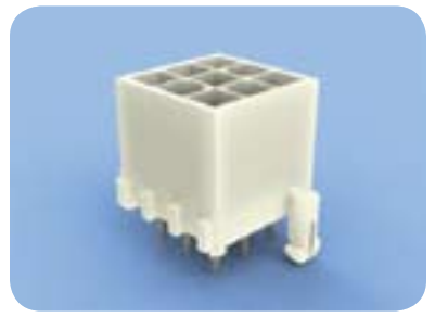
Vertical Pin Header