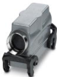
HEAVYCON B24 sleeve housing, with double locking latch, height: 72 mm, with 1 x Pg29 gland, lateral cable outlet

Please be informed that the data shown in this PDF Document is generated from our Online Catalog. Please find the complete data in the user's documentation. Our General Terms of Use for Downloads are valid ( http://phoenixcontact.com/download )