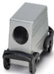
HEAVYCON sleeve housing B16, with double locking latch, height 76 mm, with 1x M32 thread, lateral conductor exit

Please be informed that the data shown in this PDF Document is generated from our Online Catalog. Please find the complete data in the user's documentation. Our General Terms of Use for Downloads are valid ( http://phoenixcontact.com/download )