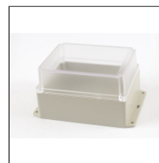
Some models supplied with deep lids.