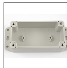
Internal DIN rail mounting point.