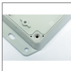
Features stainless steel inserts for lid assembly