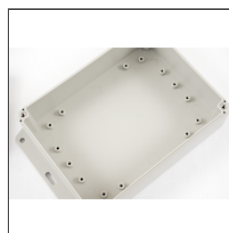
Internal mounting points for PC boards or panels