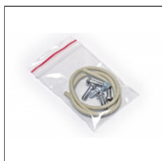
Hardware includes lid screws, PC board screws, and gasket