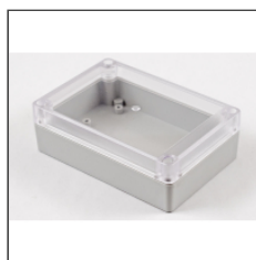
Clear Lid (polycarbonate version shown)