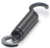
Spare recuperating spring

Replacement spring - CRIMPFOX/ SPR-3 - 1212036