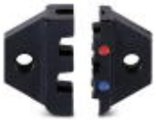
Spare die for CRIMPFOX-RCI 2,5

Replacement die - CRIMPFOX-RCI 2,5/DIE - 1212054