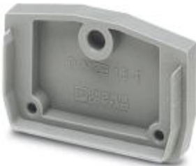
End cover, Width: 4 mm, Color: gray

Please be informed that the data shown in this PDF Document is generated from our Online Catalog. Please find the complete data in the user's documentation. Our General Terms of Use for Downloads are valid ( http://phoenixcontact.com/download )