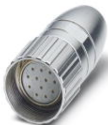
Cable connector, straight, shielded: yes, Screw locking, M23, No. of pos.: 12, type of contact: Socket, Crimp connection, cable diameter range: 7.5 mm ... 9.5 mm

Please be informed that the data shown in this PDF Document is generated from our Online Catalog. Please find the complete data in the user's documentation. Our General Terms of Use for Downloads are valid ( http://phoenixcontact.com/download )