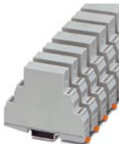
Electronic housing for distribution boards, double-level, for insertion of a p.c.b.

Please be informed that the data shown in this PDF Document is generated from our Online Catalog. Please find the complete data in the user's documentation. Our General Terms of Use for Downloads are valid ( http://phoenixcontact.com/download )