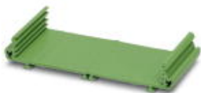
The figure shows the variant UM 45-Profil CM

Drawn section panel mounting base, with a constructional width of 108 mm and a fixed length of 200 cm